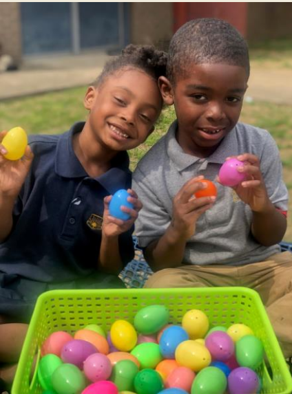
Our Kinder Scholars Had an Egg-cellent Egg-uation Math Hunt